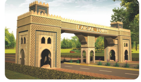
Main Gate FAISAL TOWN

Phase-1 Located on Main Fateh Jang Road. - N-80 Rawalpindi — Block A, B and C